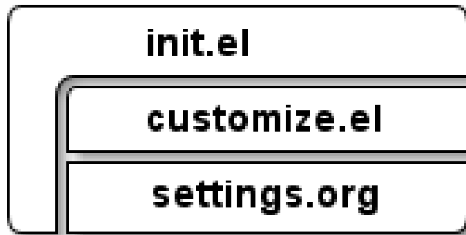
Figure 1: Current file loading structure

The structure of the loading sequence as it is today can be seen in figure ??, while the planned way to load can be found in figure ??.